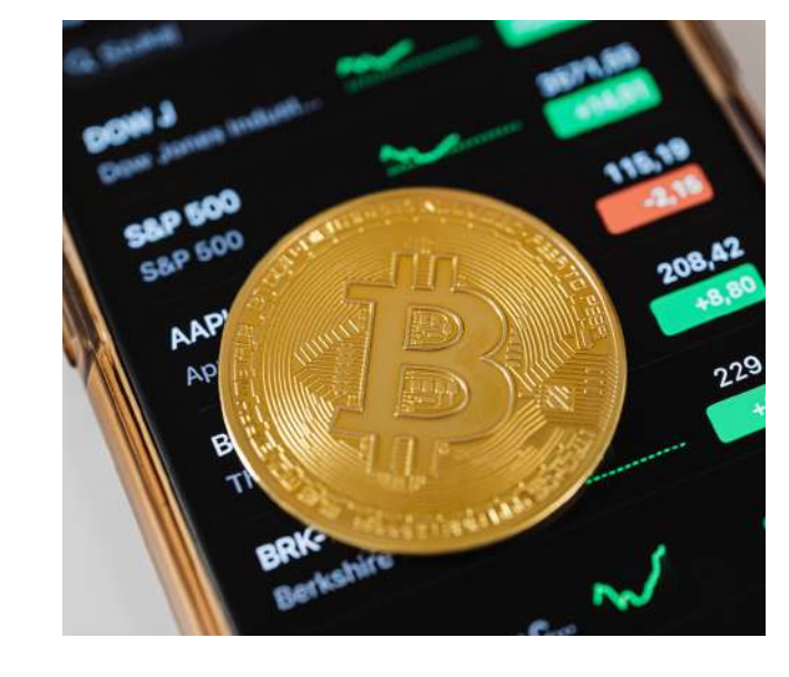
High-Tech Advancements: IT, Communication, Blockchain