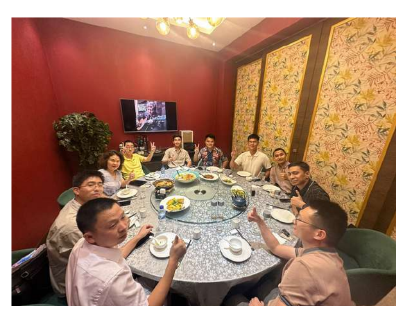
Team and Activities in Indonesia 2023