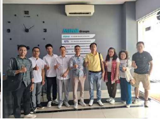
Team and Activities in Indonesia 2023