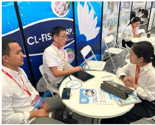
Meet with Our Customer in Shanghai World Seafood Expo 2023