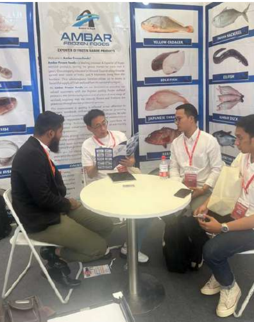
Meet with Our Customer in Shanghai World Seafood Expo 2023