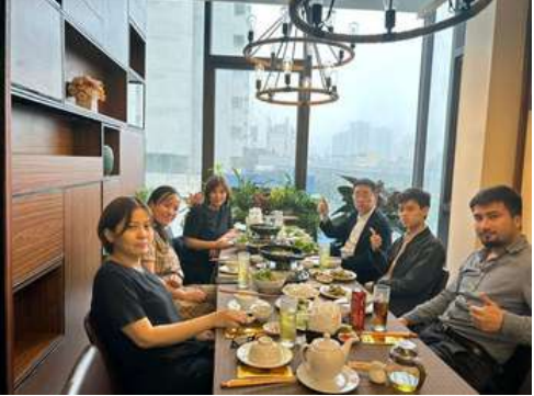
Vietnam Team and Activities