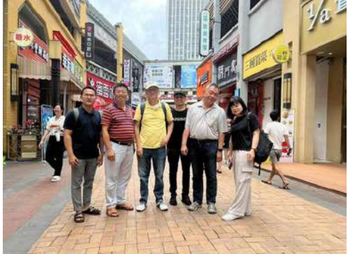
Zhanjiang Seafood Expo 2023